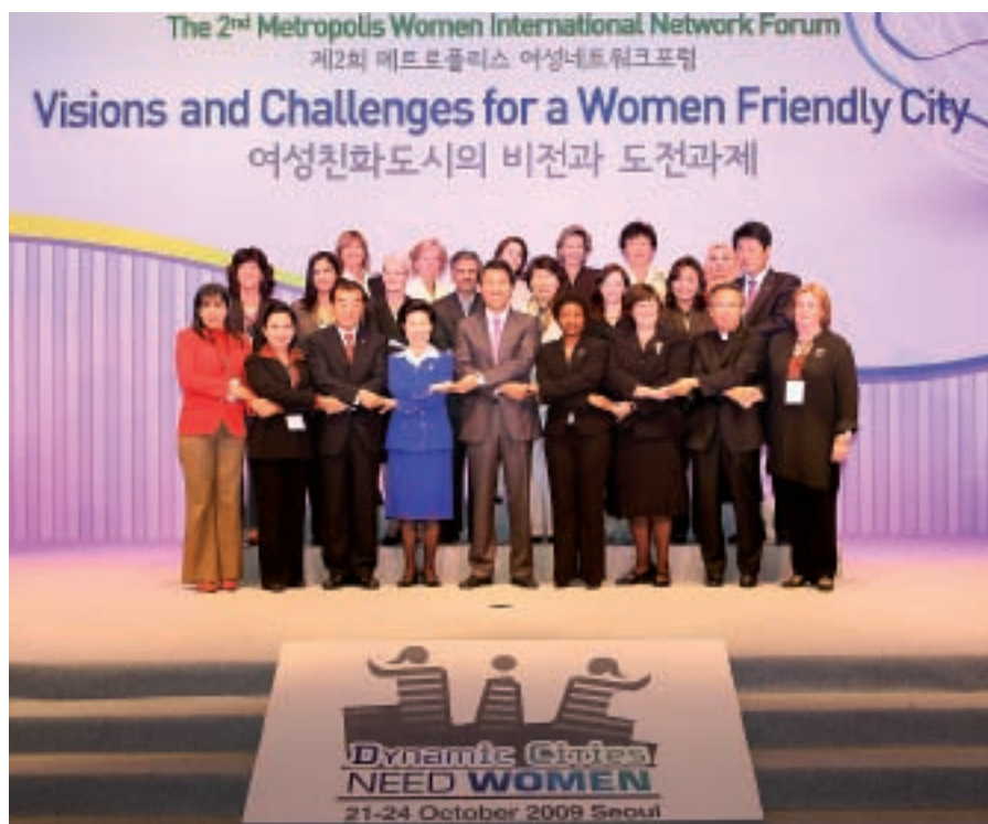
The Mayor of Seoul along with the heads of the Metropolis International Women’s Network.

The Forum concluded with the approval of the Declaration of Seoul signed in a protocol event by the president of the Metropolis International Women’s Network and the co-president of the 2 nd International Women’s Forum, as well as representatives of the different antennae of the Women’s Network. The Declaration has already been adopted by the Metropolitan Region of Chile, which is composed of 52 municipalities, and is expected to be shortly adopted by the 36 municipalities of the Barcelona Metropolitan Region.