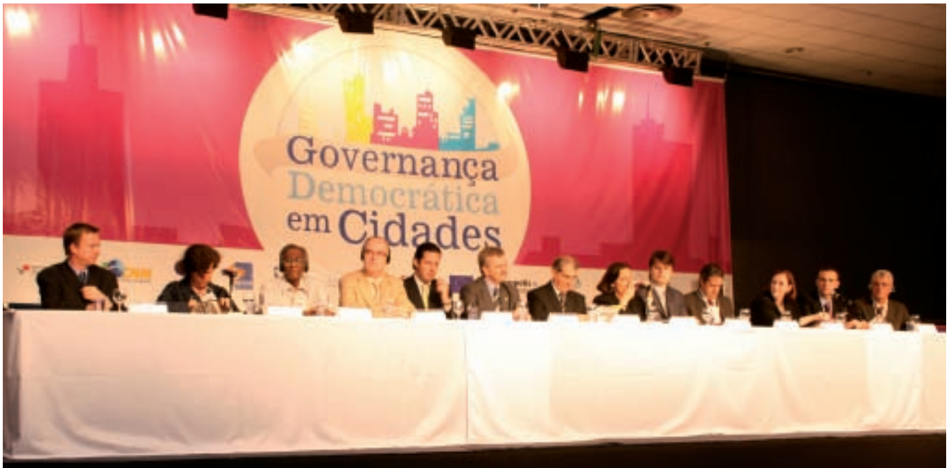
Opening ceremony of the Democratic Governance in Cities Symposium.

The first Commission 3 meeting was held in the city of Porto Alegre on 24 and 25 November. The meeting was part of the Democratic Governance in Cities International Symposium, which as well as the Metropolis event, also addressed the bases of urban innovation and participative democracy. The Symposium attracted over 700 participants from such diverse cities and institutions as Bamako, Barcelona, Belo Horizonte, Rosario, Salvador, Sao Paulo, Berlin, Edinburgh, Estado do México, Katmandu, Porto Alegre, Roma, Melbourne, UNDESA, UNESCO and CISCO Systems.