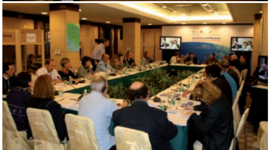
UCLG Commission Secretariats and Sections meeting.